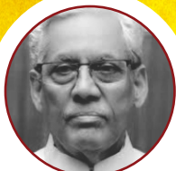
Justice S N Srivastav Legal Cell